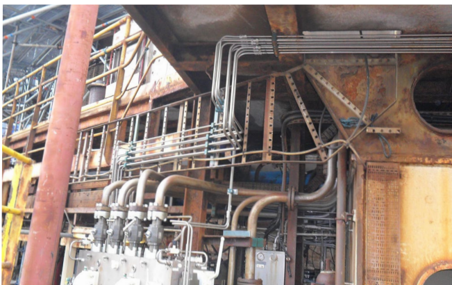
On-site pipework installation