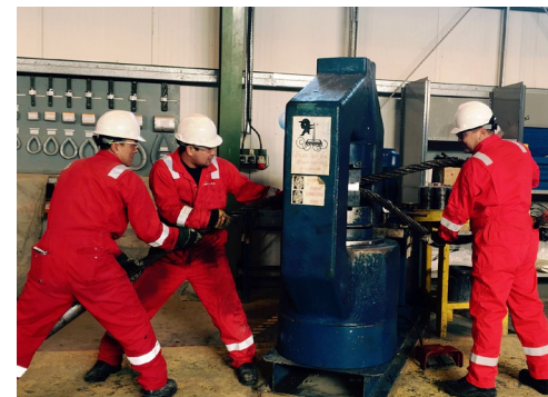
Wire rope sling manufacture